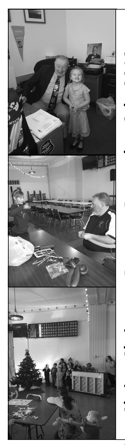
Shrine Christmas Party — December 8th, 2018